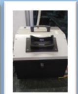
TLC UV Cabinet