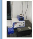
Melting Point Apparatus